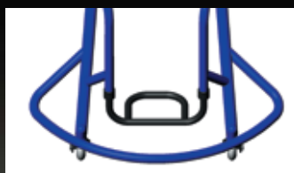
Round wing with round gussets for smooth turning.