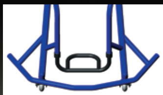
Four bend wing. Compact and great for dribbling.

New Design: The Top End design team has made improvements in multiple components on the Schulte Series BB chairs. The head tube design improvements utilize precision components that maximize stiffness, reduce play and improve overall responsiveness of the casters. Axle receives will now be locked onto the frame using the Nord-Lock bolt securing system. This system minimizes axle play so that a player's rear wheels are secure and solid for a confident feel. Lastly, sleek curved frame members add a sharp look to the camber tube, anti-tips and offensive wing.