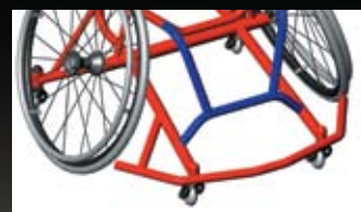
Double amputee front-end option.