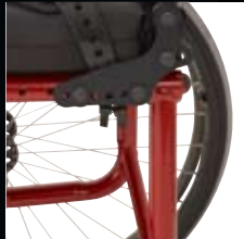
The Paul Schulte signature Chair shown with optional adjustable center-of-gravity.