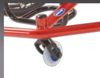
New head tube improvements reduce overall weight by 1 lb. and add precision components that maximize stiffness, reduce play and increase overall performance.