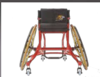
Optional adjustable height double swivel anti-tip/fifth wheel.