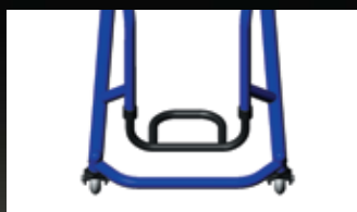
Bumper/omit wing for a more defensive setup.